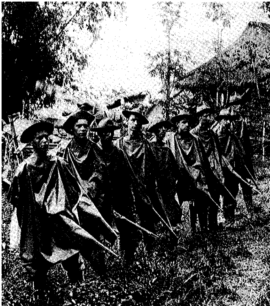
U.S. troops found the tropical climate and Southeast Asian terrain almost as deadly as combat. Thousands of soldiers were incapacitated by dysentery, malaria, and other tropical maladies. The first troops sent to the archipelago wore unsuitable woolen uniforms; these men, photographed in 1900, had at least been issued ponchos for use during the rainy season.

In the bloody battle that followed, the Filipinos suffered tremendous casualties (an estimated two thousand to five thousand dead, contrasted with fifty-nine Americans killed) and were forced to withdraw. The Philippine Insurrection had begun.