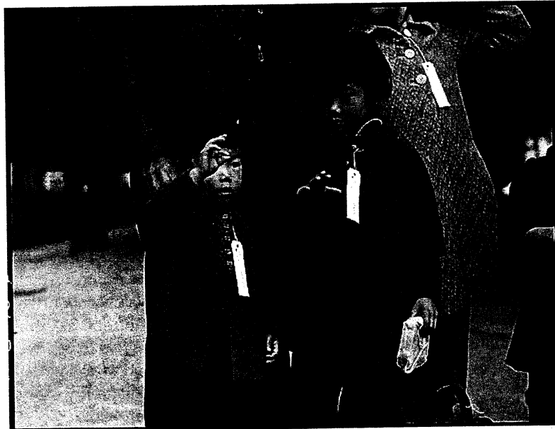
These two little girls, wearing ID tags which bear the number that was assigned to their family, are waiting in the Oakland, California, train station to be taken to an "assembly center."

The day after the Imperial Japanese government's devastating attack on Pearl Harbor, President Franklin D. Roosevelt, in his war message to Congress, declared that the day of the attack, 7 December 1941, would be "a date which will live in infamy" (1). Seventy-four days after the attack, 19 February 1942, he issued Executive Order 9066, which became the authority for the United States Army to exile nearly 120,000 persons of